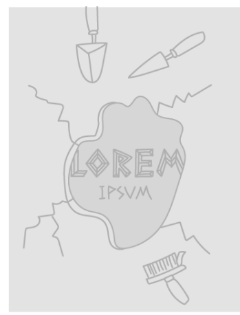
We are still trying to obtain permission for posting the original cover.