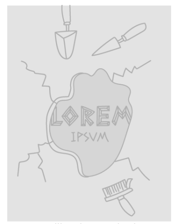
We are still trying to obtain permission for posting the original cover.