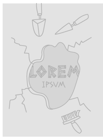
We are still trying to obtain permission for posting the original cover.