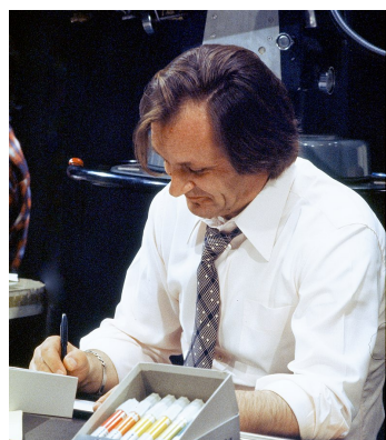
Albert Uderzo in 1973.

Retrieved from Wikimedia Commons , licensed under CC BY-SA 4.0 (accessed: December 30, 2021).