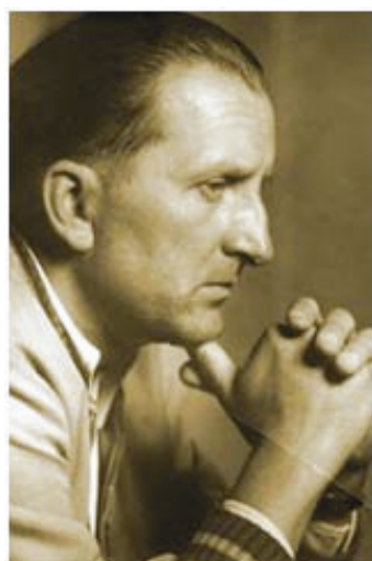
Stanisław Pagaczewski , 1916 - 1984 (Author)