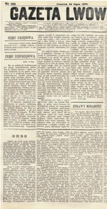
Gazeta Lwowska, Jagiellońska Biblioteka Cyfrowa, public domain.