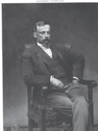
Painting of Henryk Sienkiewicz by Kazimierz Pochwański (1855–1940), retrieved from Wikimedia Commons.