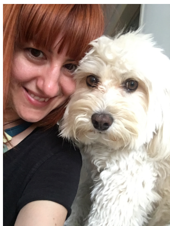
The author with her dog Lola.