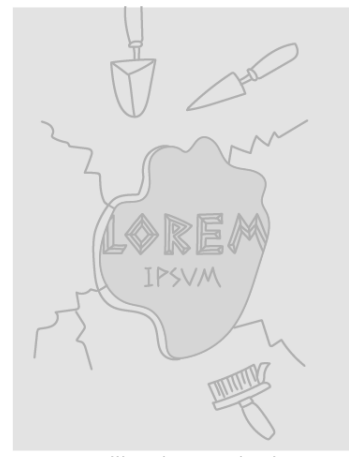
We are still trying to obtain permission for posting the original cover.