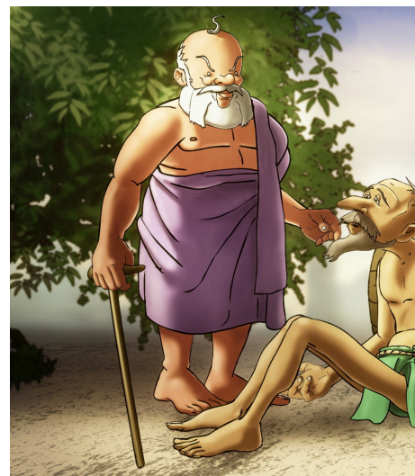
Frame from the animation (0:43), courtesy of Christof Wolf.