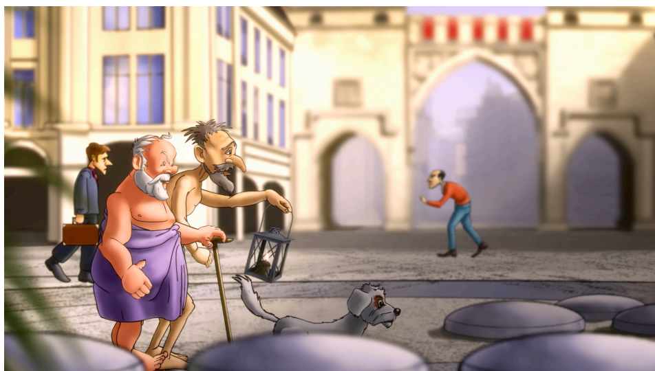
Diogenes, Socrates, and Argos are looking for real humans in Munich (1:29).