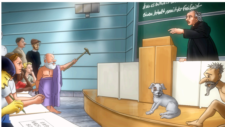
Diogenes, Socrates and Argos at the seminar (3:45).