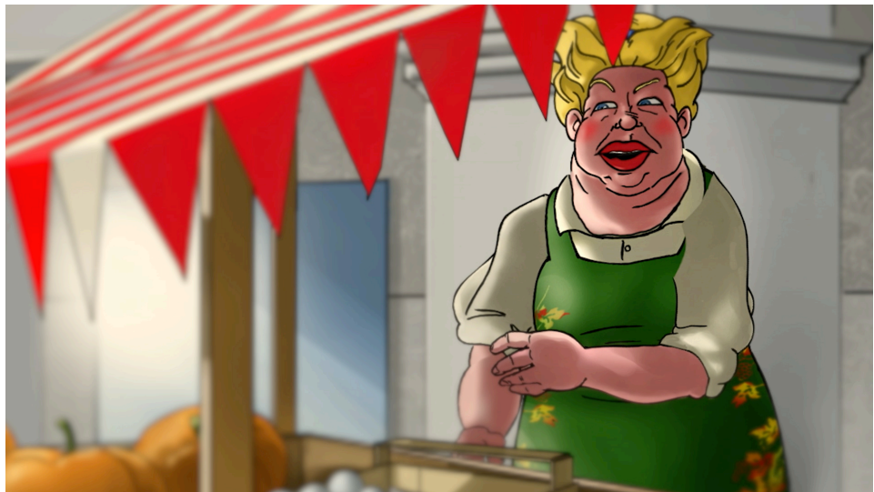
The Thracian maid*, laughing at Diogenes and Socrates (1:45).