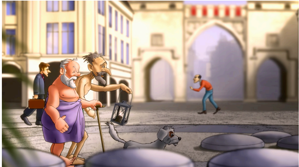
Diogenes, Socrates, and Argos are looking for real humans in Munich (1:29).