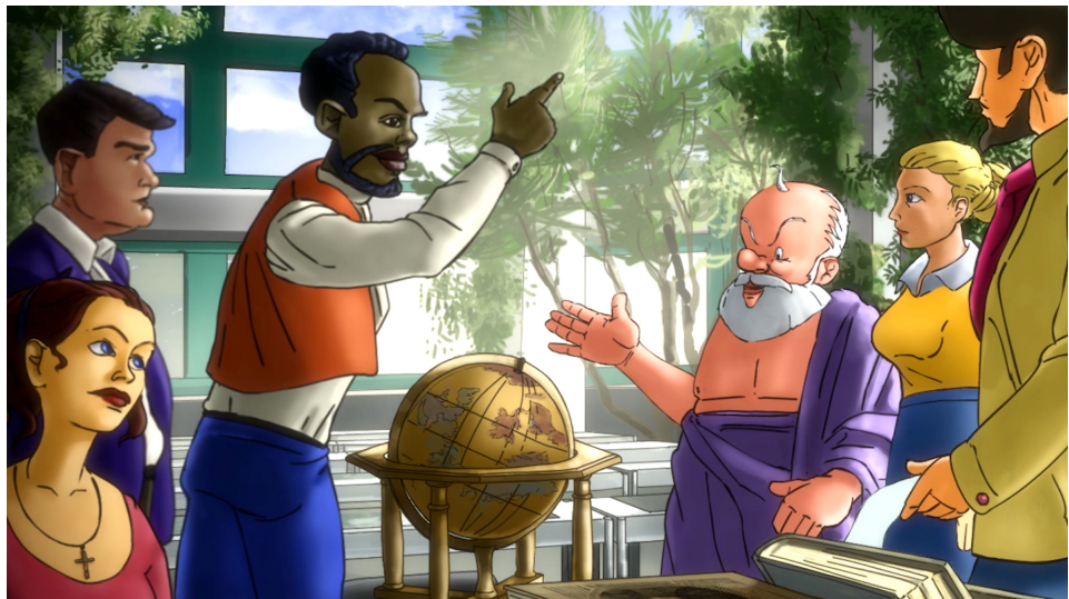
Socrates argues with students in the library of the Munich School of Philosophy (3:12).