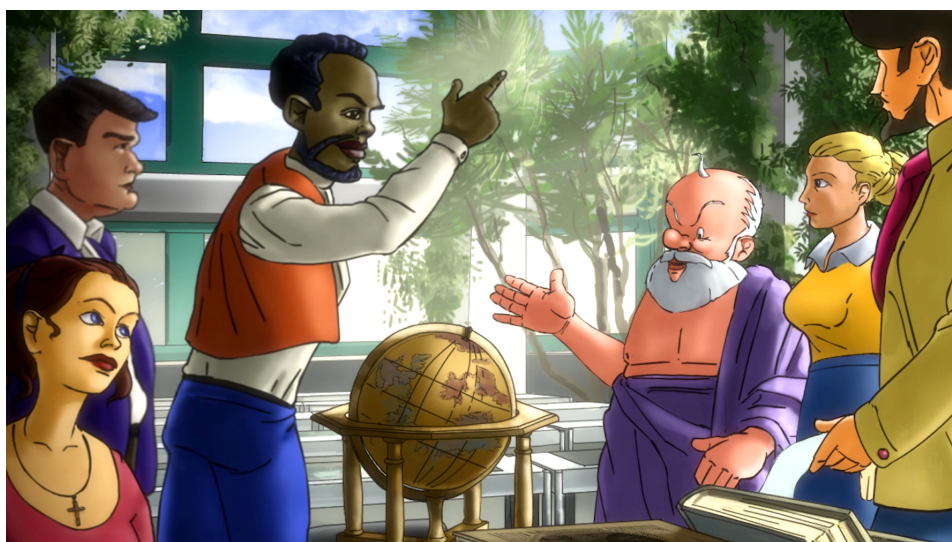
Socrates argues with students in the library of the Munich School of Philosophy (3:12).