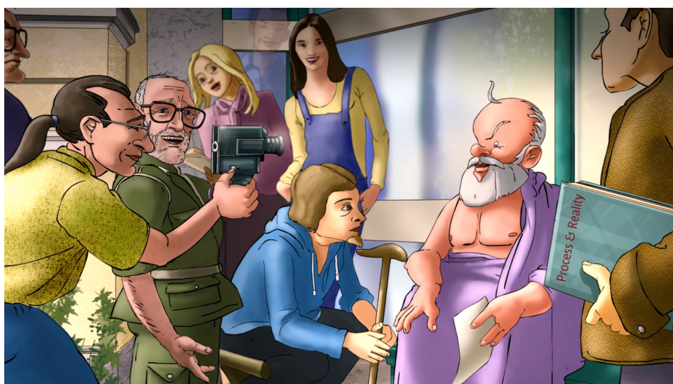
Socrates speaking about philosophy (4:07).