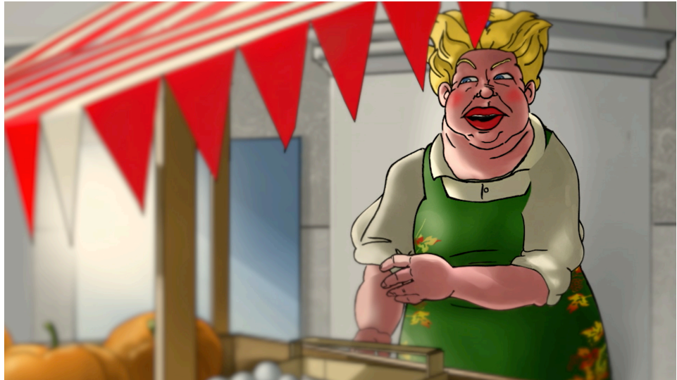
The Thracian maid*, laughing at Diogenes and Socrates (1:45).