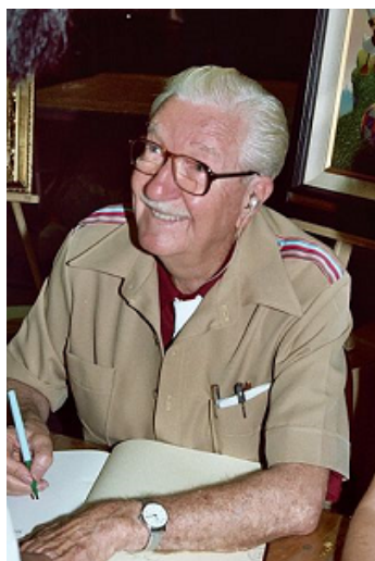
Carl Barks , 1901 - 2000 (Artist)

Carls Barks , under creative commons licence (accessed: July 4, 2018).