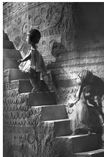
Frame from the animation.