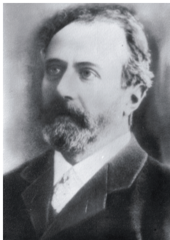
Photograph of the Author.