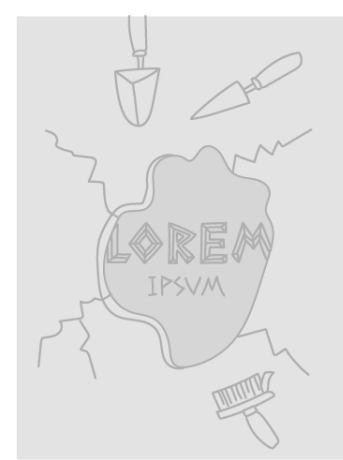
We are still trying to obtain permission for posting the original cover.