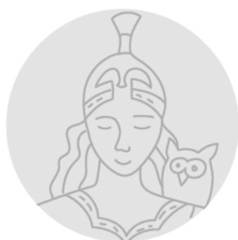
Carolyn Hennesy , b. 1962 (Author)