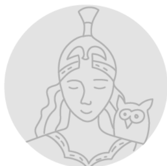
Carolyn Hennesy , b. 1962 (Author)