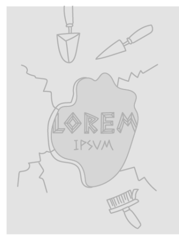
We are still trying to obtain permission for posting the original cover.