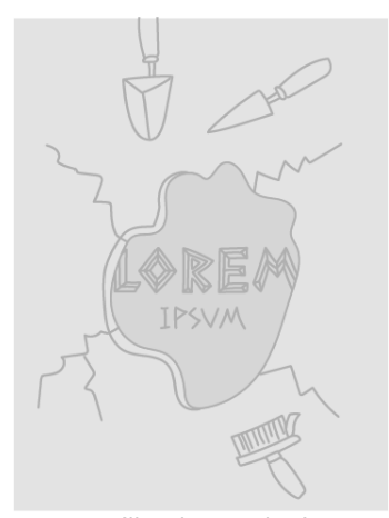
We are still trying to obtain permission for posting the original cover.