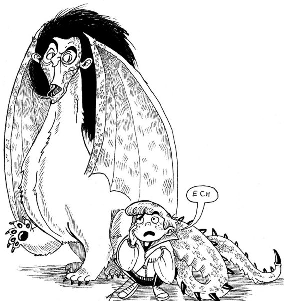
The illustration (p. 39) showing Kostek with Chimeron, courtesy of Skrzat.