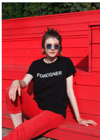
Portrait, courtesy of the Author (phot. _s_e_e_e_n).