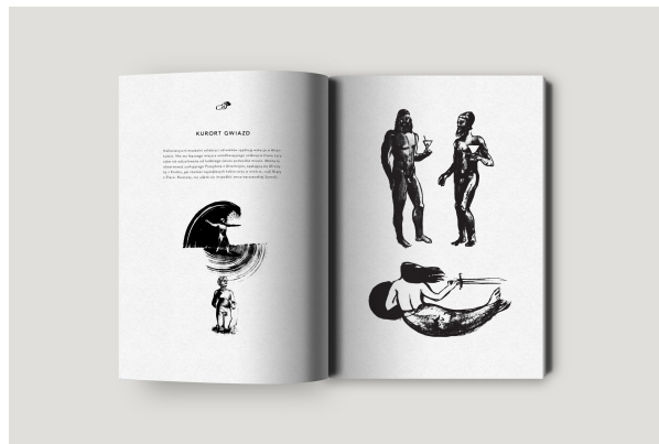
Artemision Bronze, Aphrodite of Knidos, Riace bronzes, and the mermaid of Warsaw