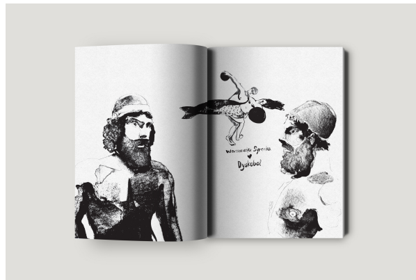
Myron's Discobolus, the mermaid of Warsaw and Riace bronzes