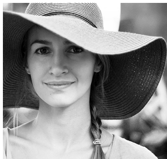
Portrait by Ignacy Frederik Heringa