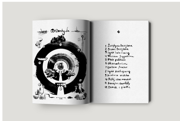
Map of the city Atlantis, including Poseidon's Temple (1), Poseidon's Gate (2), and ancient aqueducts (11).