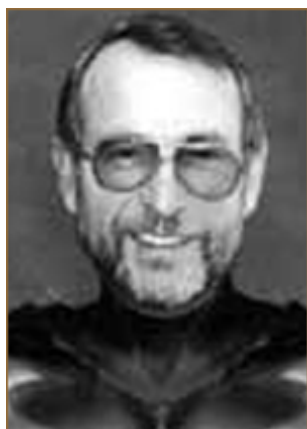
Portrait of Igor Volchek