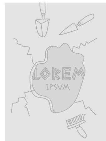
We are still trying to obtain permission for posting the original cover.