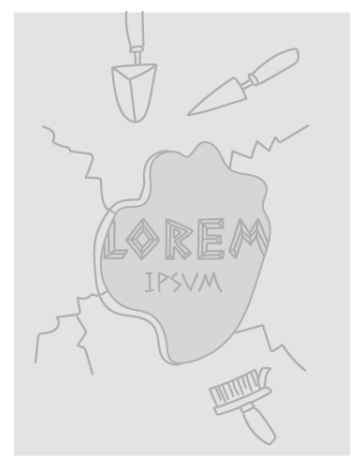
We are still trying to obtain permission for posting the original cover.