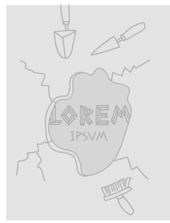
We are still trying to obtain permission for posting the original cover.