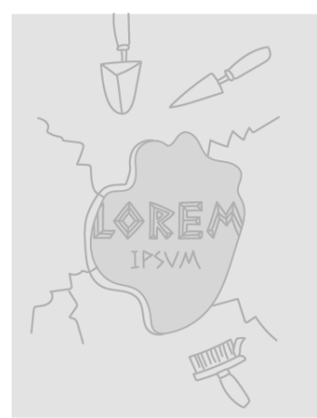
We are still trying to obtain permission for posting the original cover.