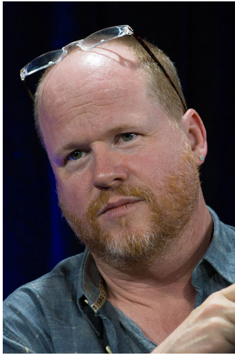
Joss Whedon by Dominick D. Retrieved from flickr.com , licensed under CC BY-SA 2.0 (accessed: December 28, 2021).

films The Avengers (2012) and The Avengers: Age of Ultron (2015), as well as Justice League .