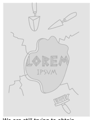
We are still trying to obtain permission for posting the original cover.