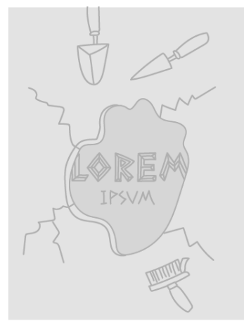
We are still trying to obtain permission for posting the original cover.