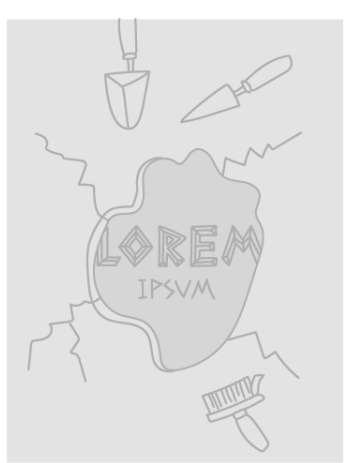
We are still trying to obtain permission for posting the original cover.