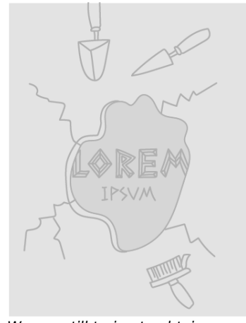
We are still trying to obtain permission for posting the original cover.