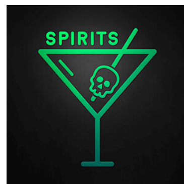
The podcast's logo, courtesy of the creators.