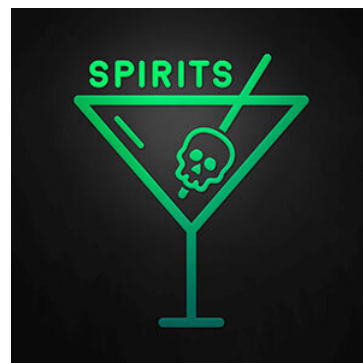
The podcast's logo, courtesy of the creators.

TAGS: Circe Cupid Eros Greek mythology Hades Heracles / Herakles Hercules Persephone Psyche Zeus