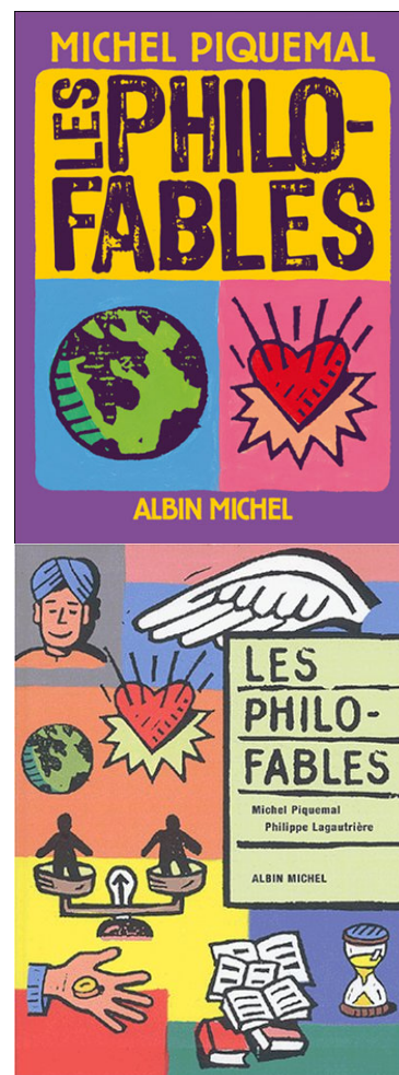
Cover: two examples of cover, the first one of 2003 and the second of one of the later reprints.